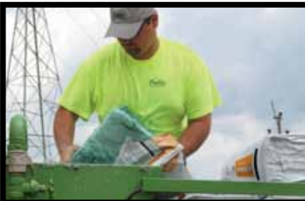
Quick and easy loading